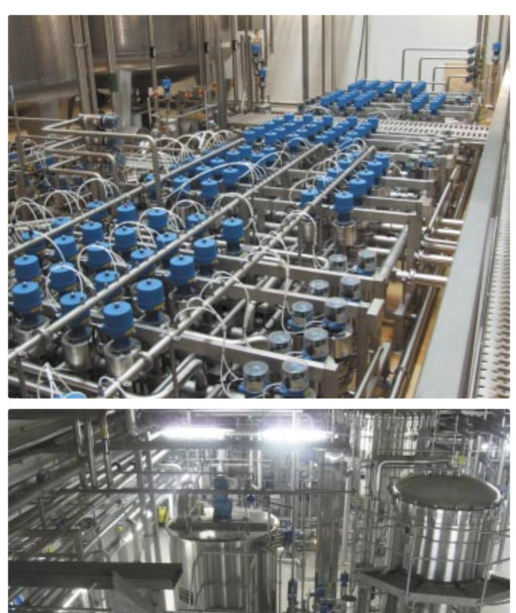
Figure 6 bottom: An automated filter plant at SABMiller's plant at Poznan in Poland.

Figure 5 below: A modern Tuchenhagen valve matrix on a tank farm.