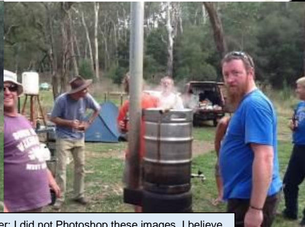
Ed Disclaimer: I did not Photoshop these images. I believe the camera was broken and has distorted the middle sections of most of the blokes that attended Steinbrew