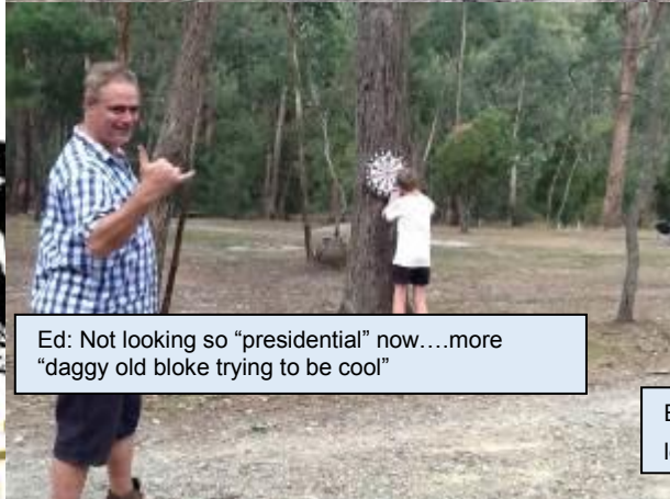
Ed: Not looking so "presidential" now....more "daggy old bloke trying to be cool"