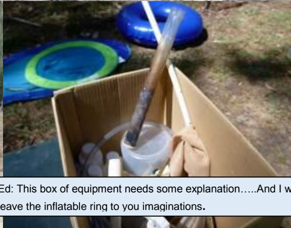
Ed: This box of equipment needs some explanation.....And I will leave the inflatable ring to you imaginations.