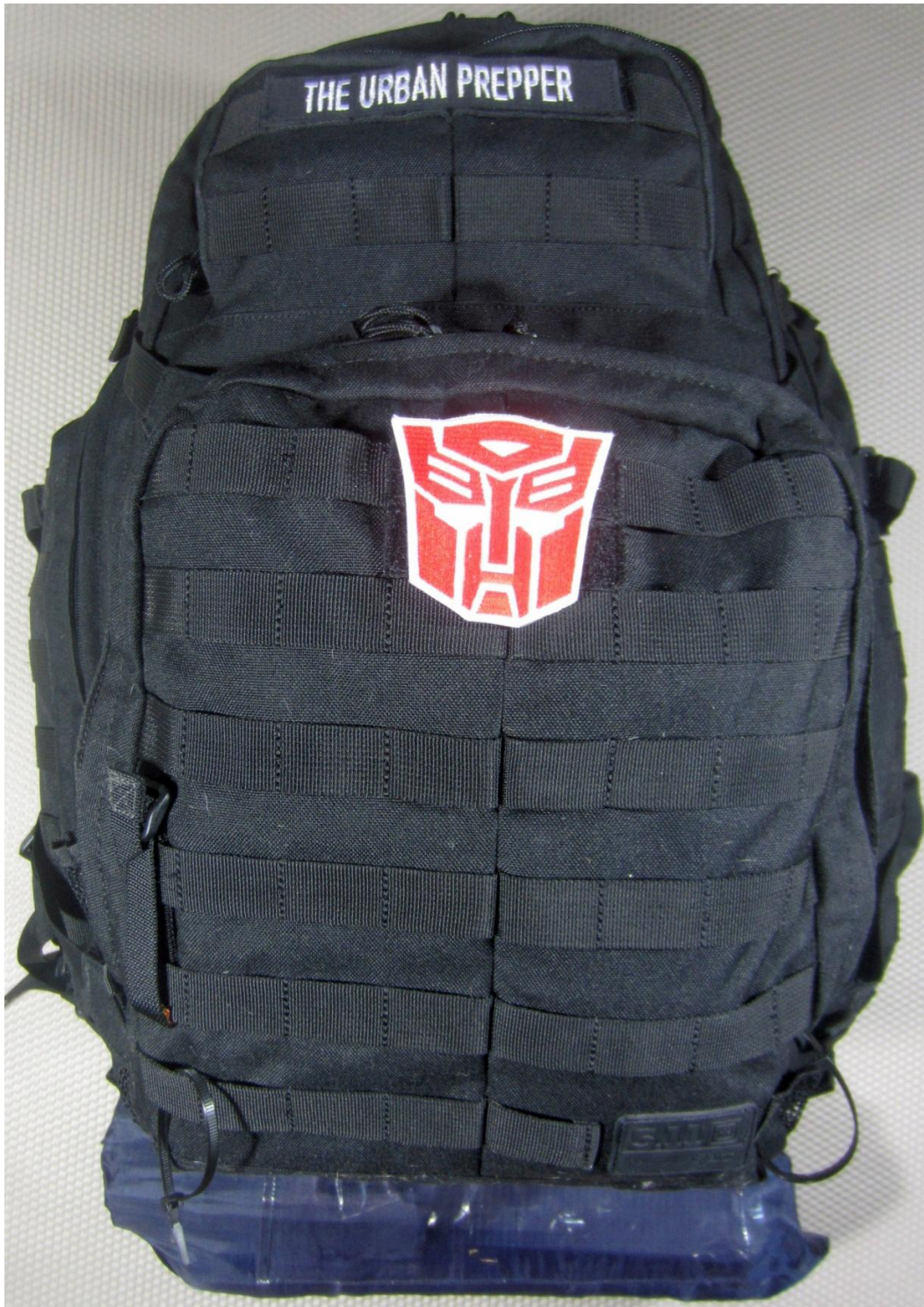
Urban Bug Out Bag