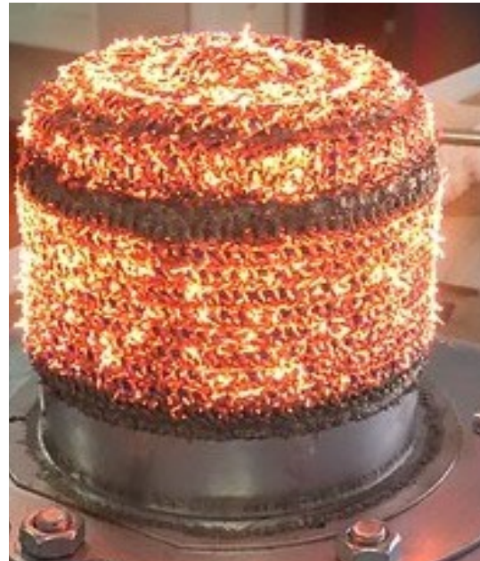
A Knitted steel fibre mesh radiant burner