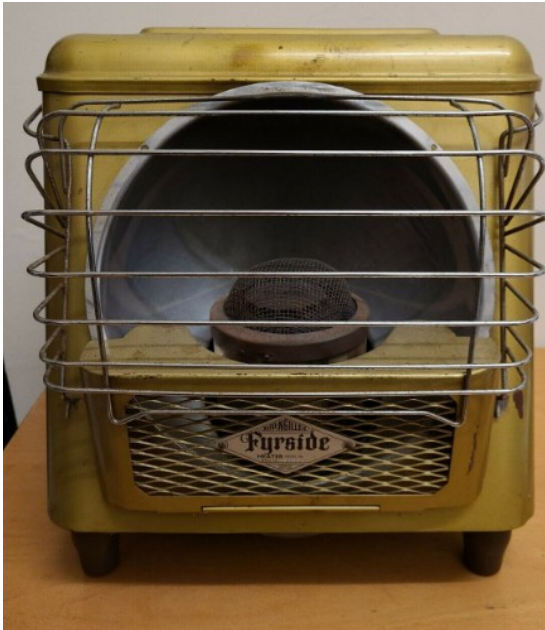
A Rippingille Radiant paraffin room heater: