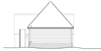
Proposed North East Elevation Scale 1:50