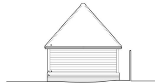
Proposed South West Elevation Scale 1:50