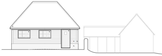
Proposed North West Elevation Scale 1:50