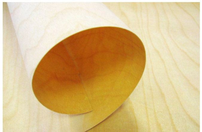
'Thin' Birch Plywood is available from stock.