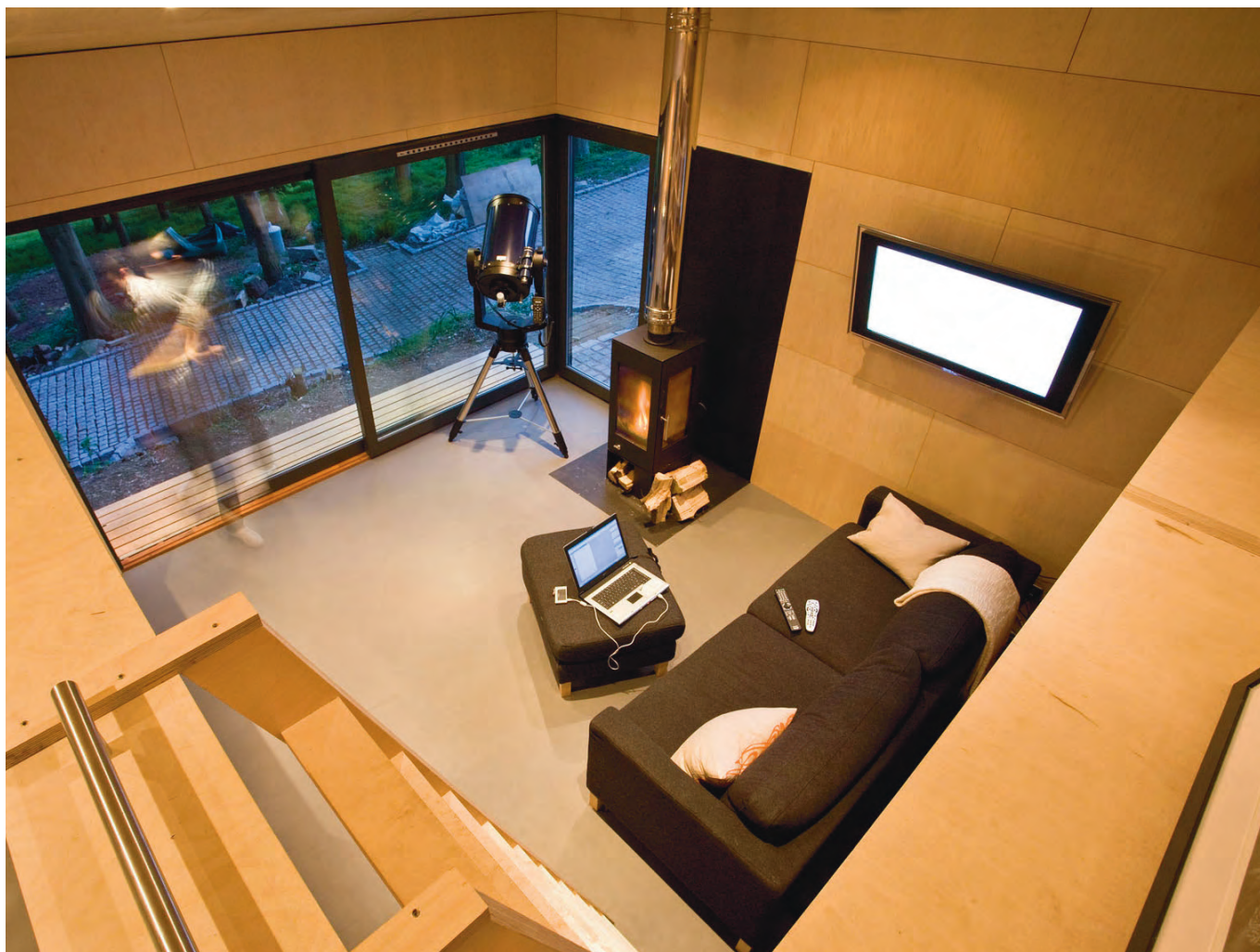
Birch plywood used to clad the walls of this contemporary garden room creates a clean, minimalist look that works well in both large and small buildings.