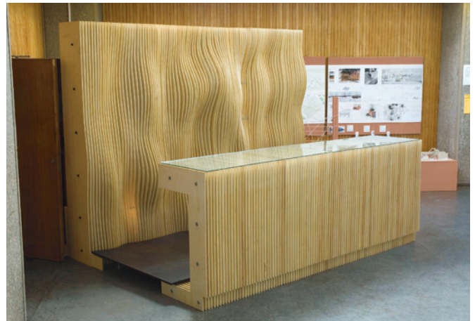
'Centenary Bar' at Sheffield University's School of Architecture, CNC machined Grade S/BB Birch Plywood with WISA-Hexagrip floor.