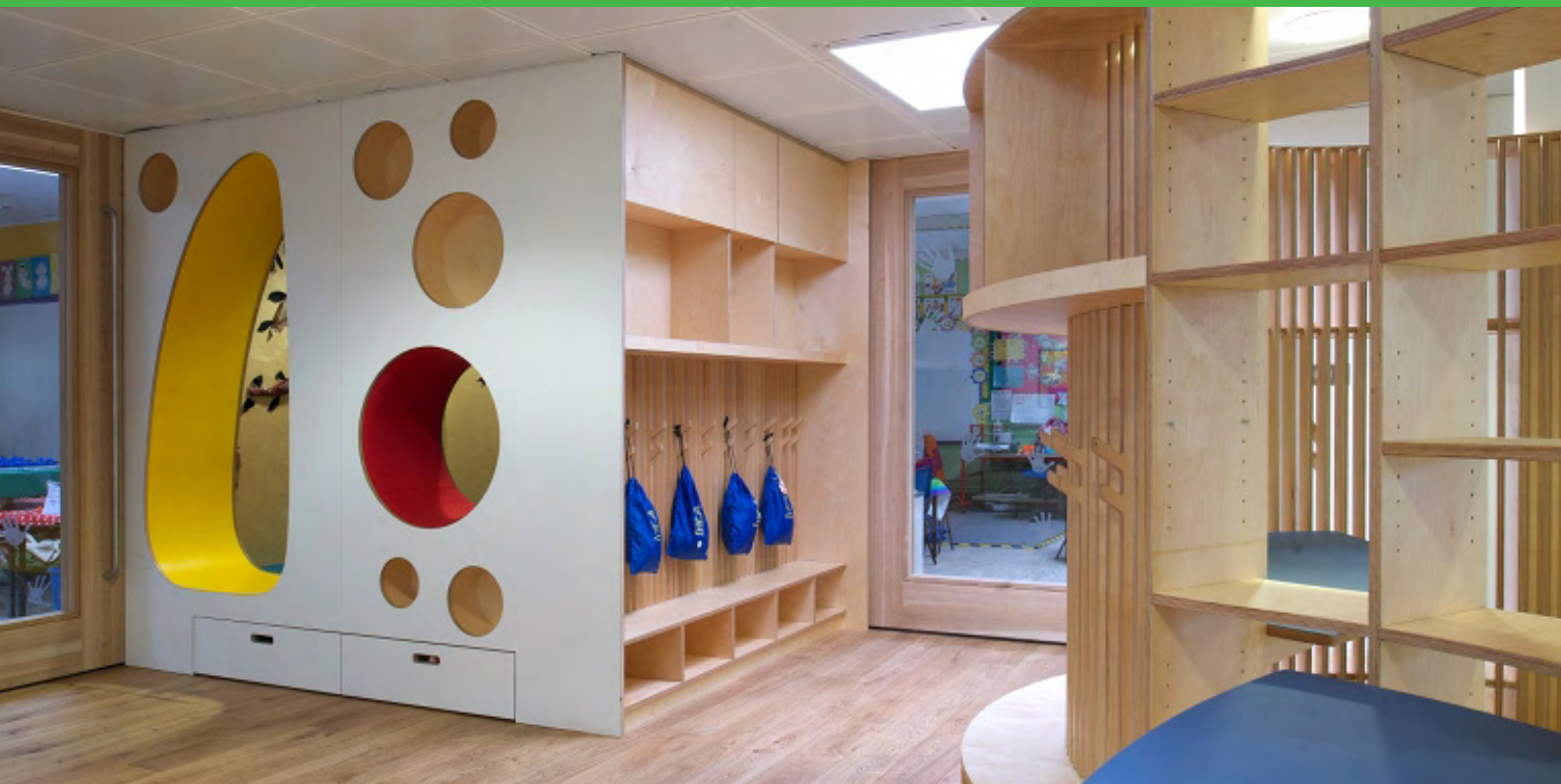
Orleans Infant School – project by DLA Architecture and Tandem.

James Latham supplies a wide range of high quality Birch Plywood and to help you get the most from this versatile product – we have improved and updated our product guide to provide more technical information.