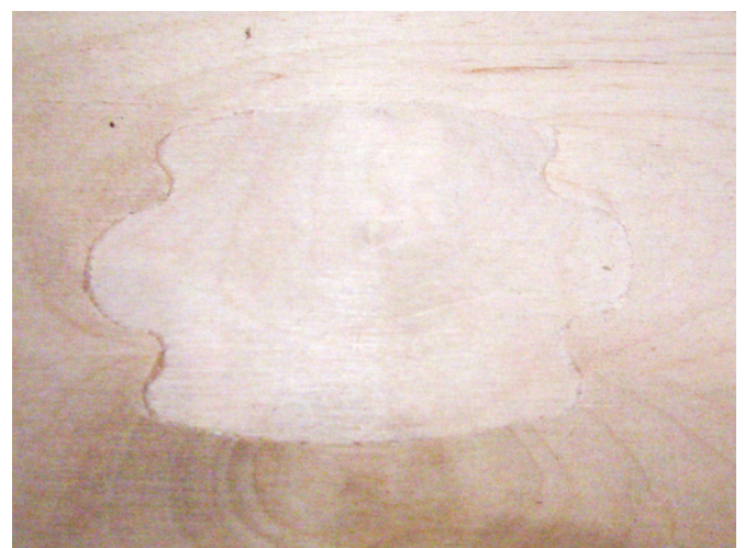
A 'Batman' shaped plug or patch – often found on BB Grade Plywood and lower. These patches are generally well made and give a sound/solid face.

Large knots / patches / open defects, staining and discolouration permitted - used for packing crates and carcass work or where unseen, such as upholstered furniture.