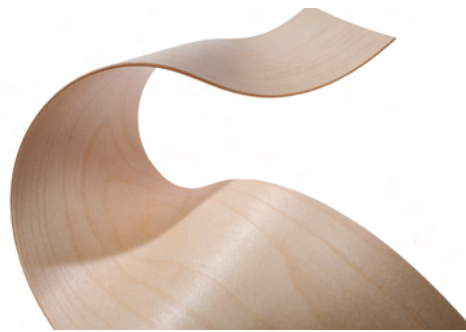
New – Grada® for curved and formed Birch Plywood components.

Grada® is an innovative concept which allows wood panels to be formed with heat and pressure. A special adhesive foil is used allowing the birch veneers to slide when heated, so curved components can be manufactured. There is minimal wastage, increased stability and greater productivity. Grada is available from James Latham branches in a range of thicknesses – from 4.5mm to 15mm. See separate brochure for more information.